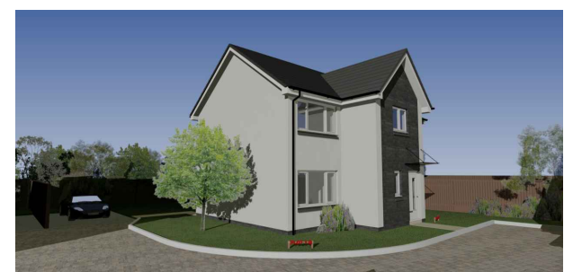
All images are artist's impression, not part of any contract and subject to alteration without notice