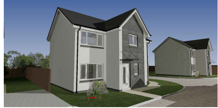
All images are artist's impression, not part of any contract and subject to alteration without notice